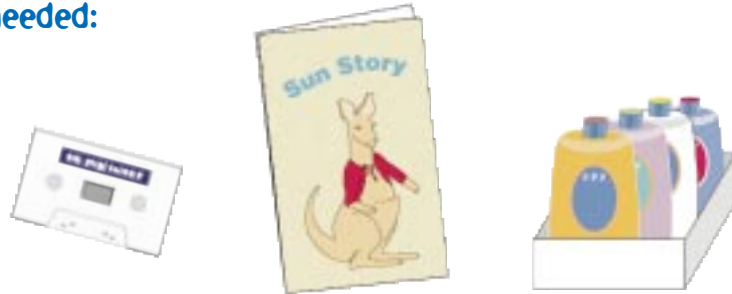
song tape with finger actions, large-size storybook, and a box of different sunscreens to show and tell